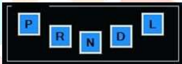
Figure 4. Gear selection controls.

These riggings are like programmed vehicles so as to productively oversee battery power, increment its working time and control speed as per the need, consequently alluding to area: 1 of IEEE Std. 1621. At whatever point gears are chosen, a clicking sound is acquainted with guarantee the client of apparatus change alluding to segment: 4.5 of IEEE Std. 1621. The rigging choice can be seen in Figure 4.