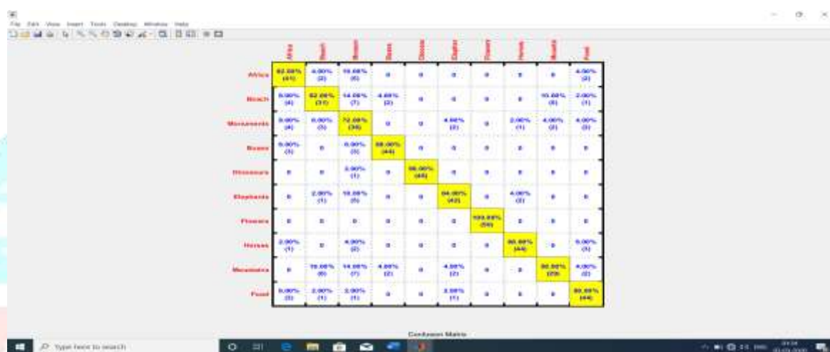
Fig. 2: Accuracy for different dataset of images

Above screen short shows the retrieved images in response to query images. With the help of GUI, we have selected image directory for processing. Then we successfully loaded the database. After that for each database DBs of image features was created. After browsed an image related to query image similar images have returned.