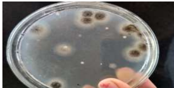
Photo 4 Growth on Sabouraud's agar