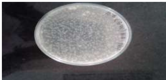
Photo 1 Growth on Nutrient agar