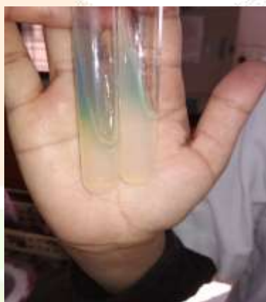
Photo 5 Growth of Pseudomonas