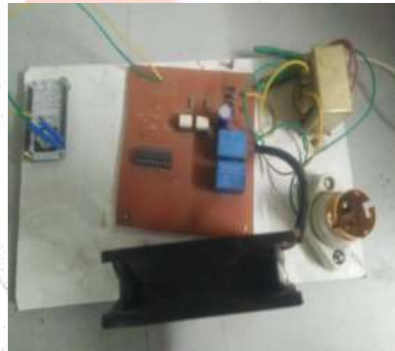
Figure 4.3 Hardware Implementaion