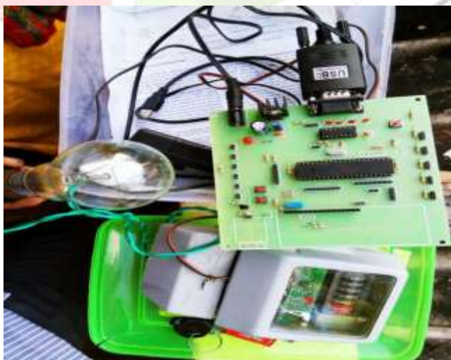
Figure-3. Prototype model.