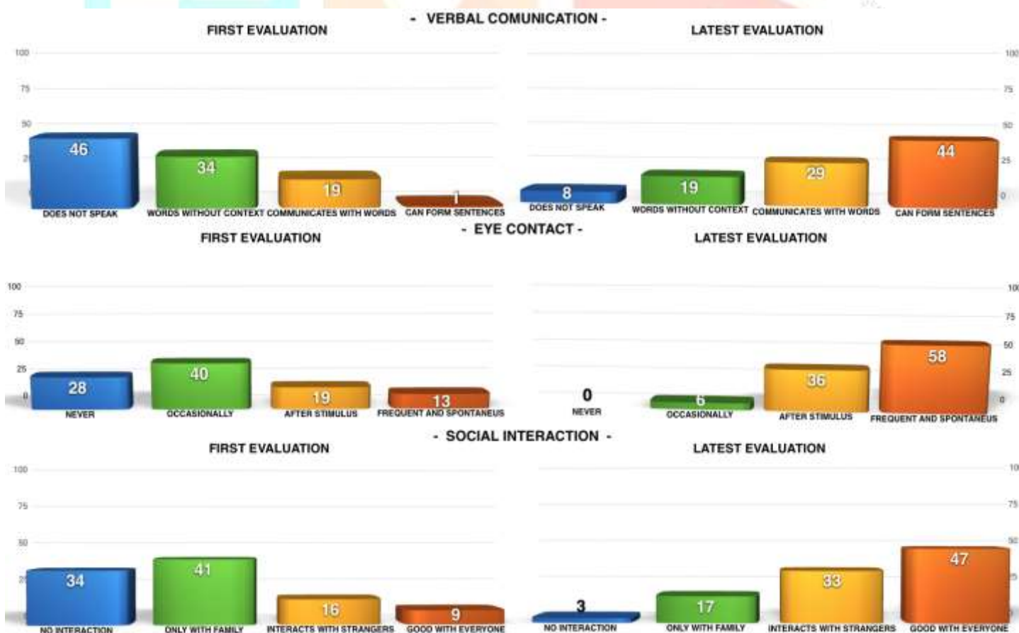
FIGURE 02: Comparative analysis of verbal communication, visual contact and social interaction of carriers of ASD before the start of treatment of food allergy and about seven months after.