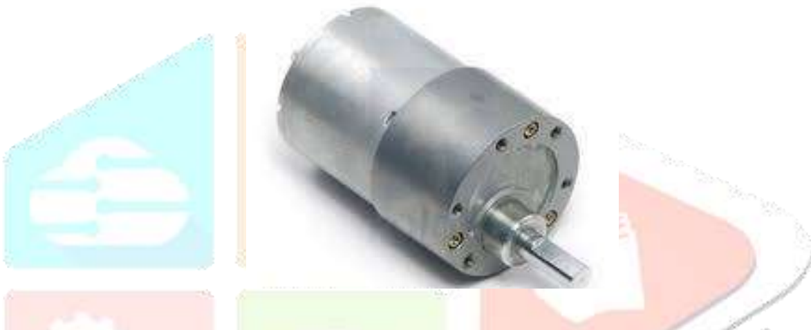
Fig. 3.8: DC motor