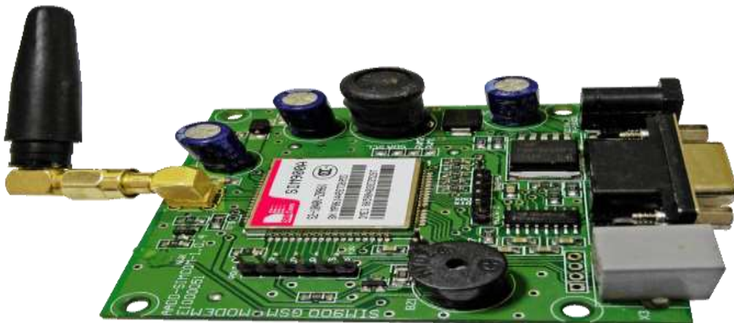
Fig. 3.3 shows the GSM Module

The GSM net used by cell phones provides a low cost, long range, wireless communication channel for applications that need connectivity rather than high data rates. Fig. 3.3 shows the GSM Module. It is used to send the SMS to mobile phone. The origins of GSM can be traced back to 1982 when the Group Special Mobile (GSM) was created by the European Conference of Postal and Telecommunications Administrations (CEPT) for the purpose of designing a pan-European mobile technology. It is approximated that 80 percent of the world uses GSM technology when placing wireless calls, according to the GSM Association (GSMA), which represents the interests of the worldwide mobile communications industry. This amounts to nearly 3 billion global people.