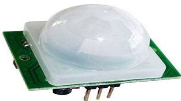
Fig. 3.5: Human Detection using PIR Sensor

Passive Infra-Red sensors (PIR sensors) are electronic devices which measure infrared light radiating from objects in the field of view. PIRs are often used in the construction of PIR-based motion detectors, shown in fig.3.5. Apparent motion is detected when an infrared emitting source with one temperature, such as a human body, passes in front of a source with another temperature, such as a wall.