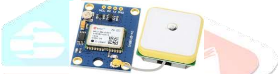
Fig. 3.2 shows the GPS Module

GPS stands for Global Positioning System. Fig.3.2 shows the diagram of GPS. The GPS is used to receive the position data from the vehicles and display on a digital map. It will have the interface to the communication link. Enhanced features include video features, trace mode, history track, vehicle database, network support. The Global Positioning System (GPS) is a satellite-based navigation system made up of a network of 24 satellites placed into orbit by the U.S. Department of Defense. GPS was originally intended for military applications, but in the 1980s, the government made the system available for civilian use. GPS works in any weather conditions, anywhere in the world, 24 hours a day. There are no subscription fees or setup charges to use GPS.