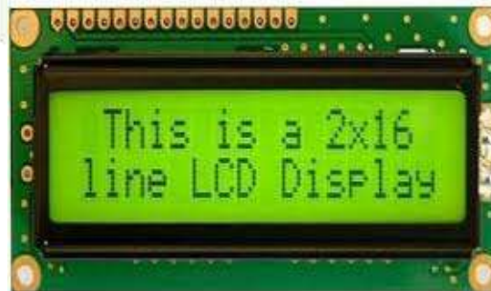
Fig. 3.9: LCD Display

It is used for displaying alphabets, numbers and also special symbols. Fig. 3.9 shows the LCD Display. The proposed system uses 16*2 alphanumeric display.