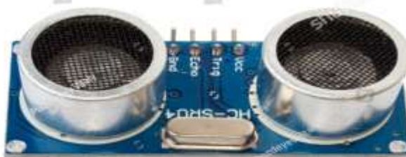
Fig. 3.6: Distance Measurement Using Ultrasonic Sensor

The flaws in the form of cracks, blowholes, porosity in metallic pipes can be detected using the ultrasonic waves. Fig. 3.6 shows the circuit of the distance measurement using ultrasonic distance meter. The ultrasonic sensor works on the principle of reflection of waves. The crack can be detected by measuring the time interval of reflected beam.