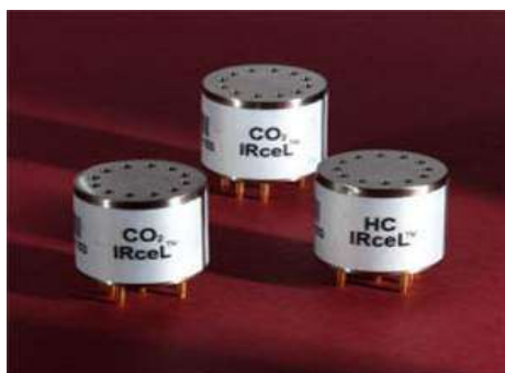
Fig. 3.4: IR Sensor

Infrared transmitter is one type of LED which emits infrared rays generally called as IR Transmitter. Fig. 3.4 shows the crack detection using IR sensor. Similarly IR Receiver is used to receive the IR rays transmitted by the IR transmitter. One important point is both IR transmitter and receiver should be placed straight line to each other.