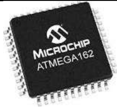
Fig.3.1: Microcontroller ATmega162