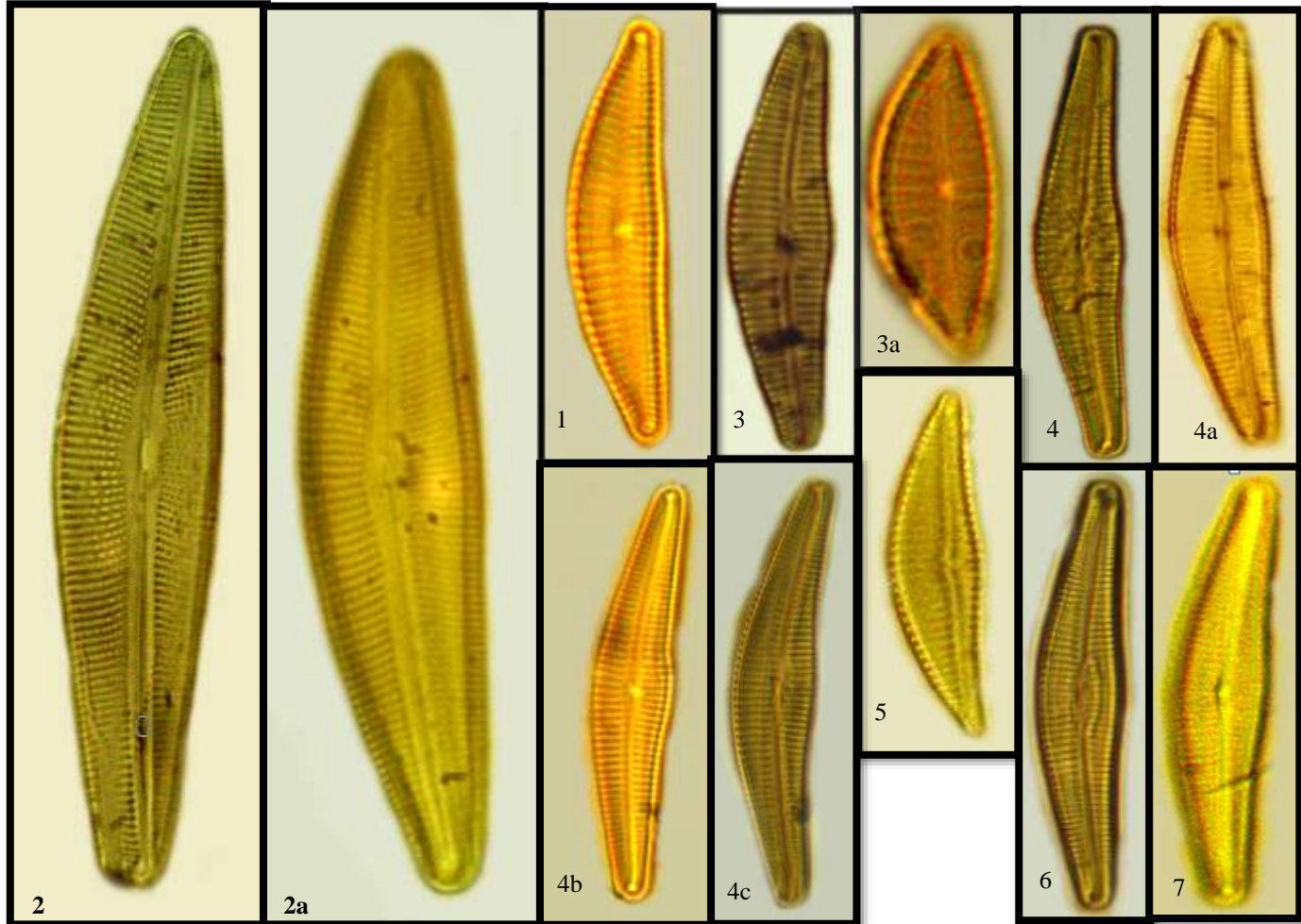
PLATE - 1

Valve with slight dorso-ventral asymmetry, broadly lanceolate, and on the dorsal side slightly more convex than the ventral side. Apex simply diminished or stretched into a fairly short, more or less fine point, and rounded. Maximum length and width ratio: 3.9. Longitudinal area of moderate width, gradually widening to the central area. Fairly large central area, rounded to lozenge-shaped, often extending more over one side asymmetrically. Slightly oblique raphe, becoming threadlike at the proximal endings and distal: proximal endings sometimes bending on the ventral side and distal on the dorsal side. Radiant, finely punctuated streaks, punctuation (32 to 36 areoles in 10 µm). Length 43 to 62µm, Width 13 to 16µm and 9 to 10 ridges (dorsal) in 10µm in the center and up to 14 at the ends. Distribution freshwater.