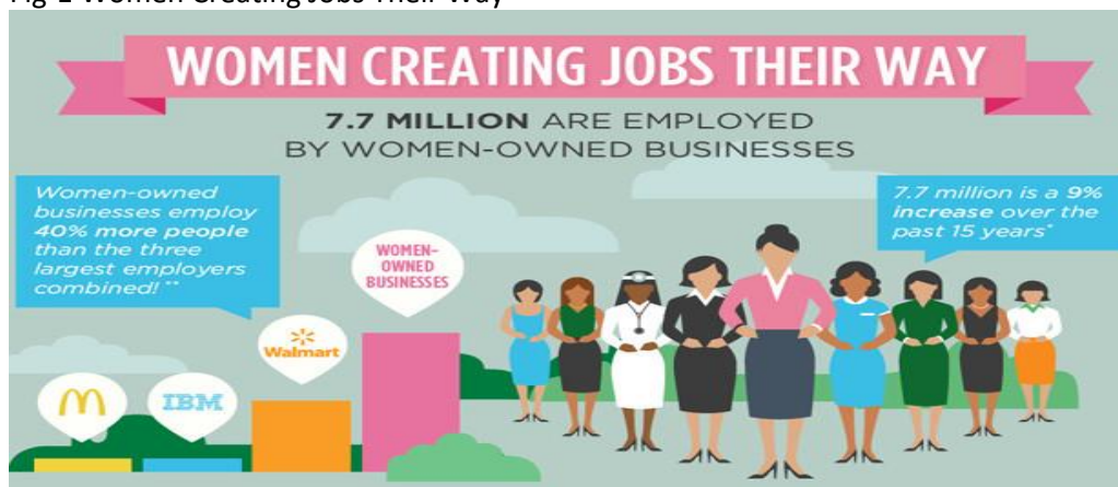
Fig-1 Women Creating Jobs Their Way

In most countries, regions and sectors, the majority of business owner/managers are male (from 65% to 75%). However, there is increasing evidence that more and more women are becoming interested in small business ownership and/or actually starting up in business (as shown in fig-1).