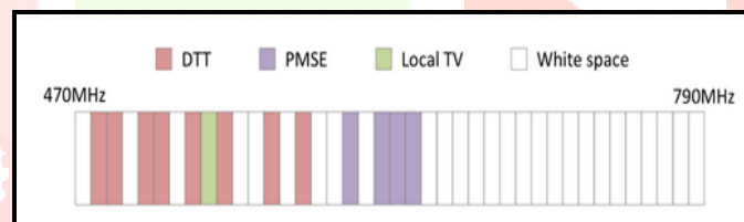
Figure 3: White spaces in a specific location

The FCC Second Memorandum Opinion and Order established the TV white space rules. Various unlicensed devices, called White Space Devices (WSDs), can make use of a particular TV channels in the VHF or UHF bands. The Commission allow fixed and personal/portable unlicensed devices that will operate in the TV bands. The Commission allow fixed devices to operate on any channel between 2 and 51, excluding channels 3, 4 and 37 and also personal portable devices to operate on channel between 21 and 51, except channel 37.