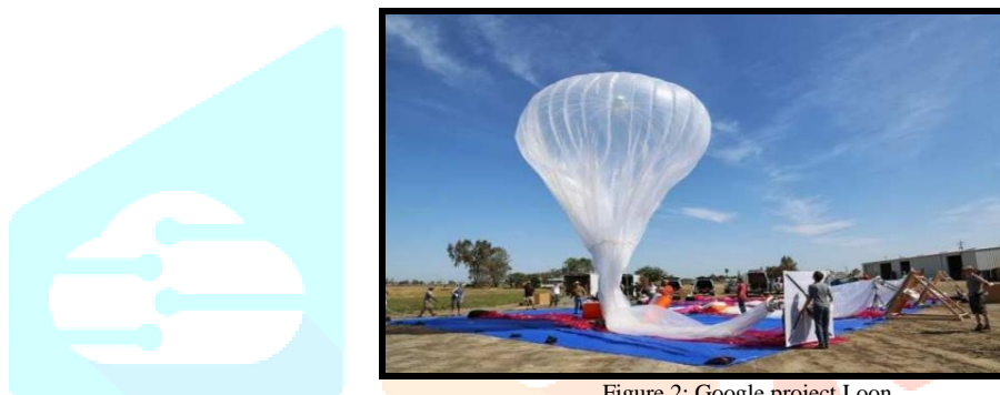
Figure 2: Google project Loon

A new project, the project Loon is proposed by Google that can provide internet access to remote and rural areas. It was launched in 2013. The Loon network, balloons travel around the Earth and bring access points to the users who cannot connect directly to the global wired Internet. Deployment of base stations for every location on the Earth seems to be impossible. It is a concept of providing Internet from the sky. Balloon network is formed in the sky that will transmit signals to nearest base stations and ISPs on earth. One balloon can provide connectivity to a ground area about 70 to 80 km in diameter using a wireless communications technology.