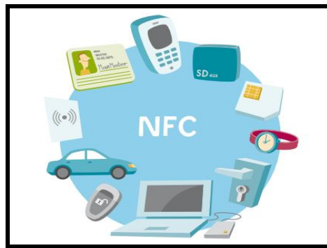
Figure 3: Components of an NFC ecosystem

NFC enabled SIM cards are to become a worldwide standard. The GSM Association has announced that a consortium has been formed and has committed to support and implement SIM cards, embedded with NFC. Both SIM and SD cards can be equipped with NFC chips and some companies are preparing to offer these options so large number of customers can start using NFC technology. For example, merely touching a film poster equipped with an NFC chip with an NFC capable device enables a trailer to be displayed and tickets to be reserved at the nearest cinema, shelves in the supermarket which are equipped with NFC provide information about the origin and treatment of fruit and vegetables, can indicate whether the engine oil is suitable for car. [7], [8]