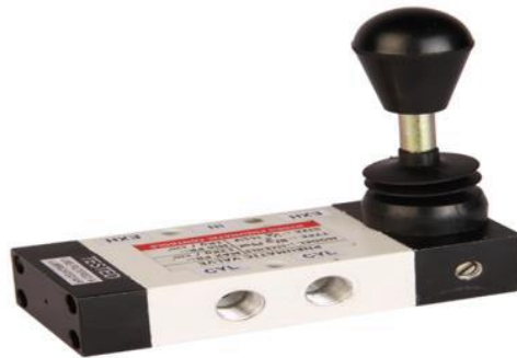
Fig-02: Directional control valves