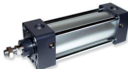
Fig-02: Double acting Pneumatic cylinders

Pneumatic cylinders are mechanical devices which use the power of compressed gas to produce a force in a reciprocating linear motion. Like hydraulic cylinders, something forces a piston to move in the desired direction. The piston is a disc or cylinder, and the piston rod transfers the force it develops to the object to be moved.