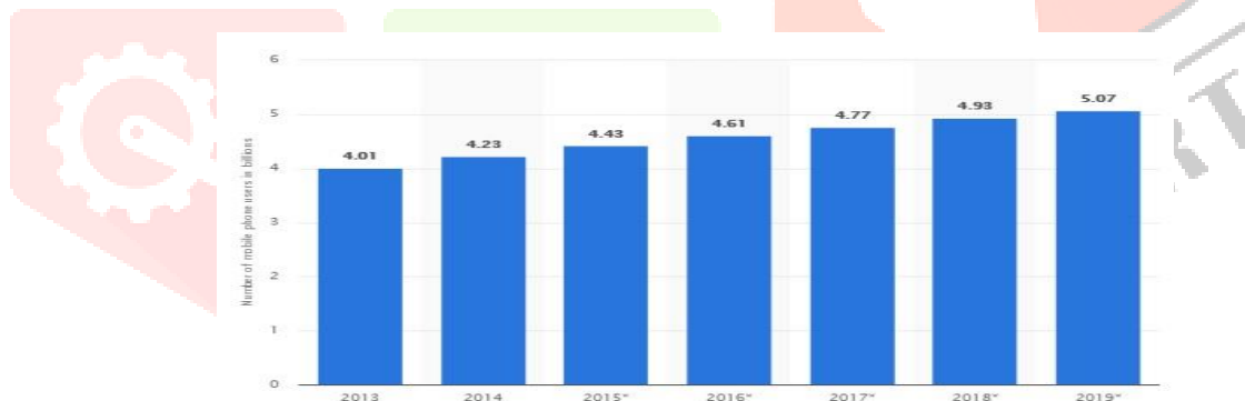
Fig 1. Number of mobile phone users globally from 2013 to 2019 (in billions)[1]

Around 2014, 38% of all users. Around 2018, this number is expected to arrive at over 50%. A number of Smartphone users may grow by one billion globally within five years, in other words, Smartphone users in the world may reach up to 2.7 billion by 2019. Samsung and Apple are leading Smartphone vendors, with about 18 % of the market divide each.[1]