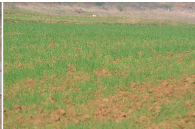
Agriculture Crops inside Dam