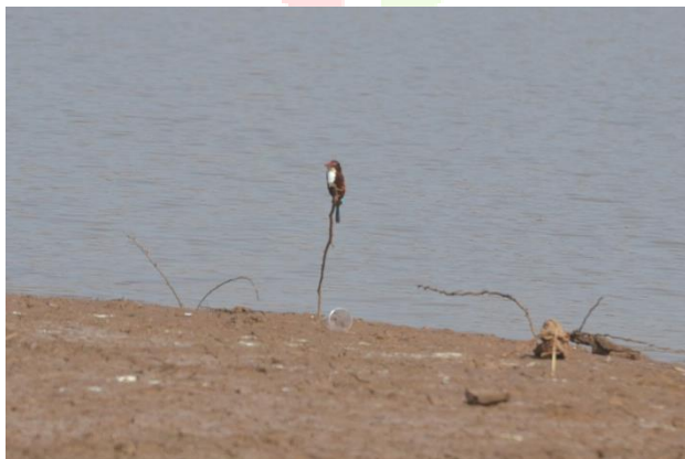
White throat Kingfisher