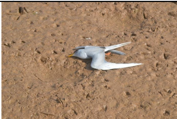
Hunting of Bird