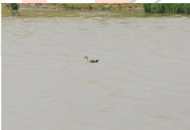
Lesser whiting duck