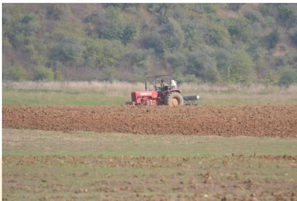
Plugging agriculture field inside Dam