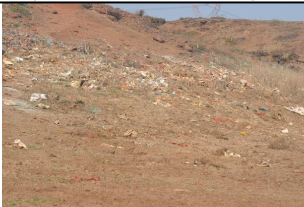
Dumping of waste material