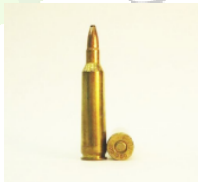
Figure 3 .22-250 Remington rifle

Figure 3 shows the bullet considered for finite element analysis. Dimensions of the bullet are, Bullet diameter .224 in (5.7 mm) Neck diameter .254 in (6.5 mm) Shoulder diameter .414 in (10.5 mm) Base diameter .469 in (11.9 mm) Rim diameter .473 in (12.0 mm) Case length 1.912 in (48.6 mm) Overall length 2.35 in (60 mm) Rifling twist 1-12, 1-14 Primer type Large rifle. The .22-250 Remington is a very high-velocity (capable of reaching over 4000 feet per second), short action, .22 caliber rifle cartridge primarily used for varmint hunting and small game hunting, though it finds occasional use on deer. This cartridge is also sometimes known as the 22 Varminter or the 22 Wotkyns Original Swift. Along with the .220 Swift, the .22-250 was one of the high-velocity 22 caliber cartridges that developed a reputation for remote wounding effects known as hydrostatic shock in the late 1930s and early 1940s.