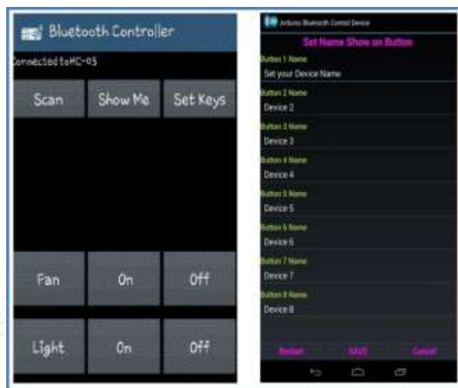
Fig1.1: Snapshot of the Application

easily accessible, enhances easy operation and eliminates the traditional method of switching. It has been linked via the Bluetooth module HC-05. The control action has been done by relay. The Fig1.1 provides the snapshot of the used android application.