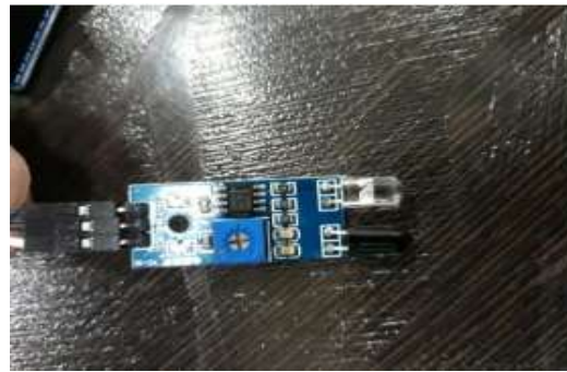
Fig. IR Sensor

:Whole assembly of automatic clutch and braking system consists of following main parts. Frame: Frame is made up of 40C8 material. Frame is generally made up in order of required dimensions. Dimension of frame Length: 24 inch Width: 18 inch Height: 5 inch. DC Motor: One D.C. motor is mounted on one wheel to provide free rotation of wheels Specification of MOTOR Torque: 200mm Volt :12V DC, IR sensor and control unit IR sensor unit is mounted back side of frame. External power supply is provided to IR Sensor. Control unit is connected to solenoid valve in order to actuation of valve. Two working wheels of free rotation are mounted on both end of metal shaft. Two ball bearings are provided foe smooth rotation of both wheels and both ball bearings are mounted on rectangular bar.