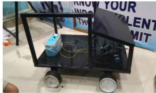
Fig. Actual model for regenerative braking