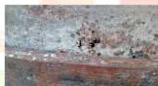
Fig. 1 M.S. Plates

For solving this entire problem we need to change the material of the plate and find the best material for the plate which provides us a more strength and light weight in nature.