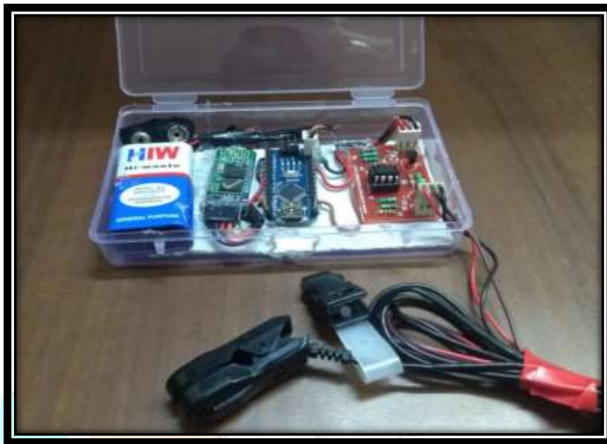
Fig: Heart Monitor System

then alert system gets activated and alert messages are sent to the people whose information is provided by the user during registration and also, the nearby hospitals are informed using KNN and haversign algorithm.