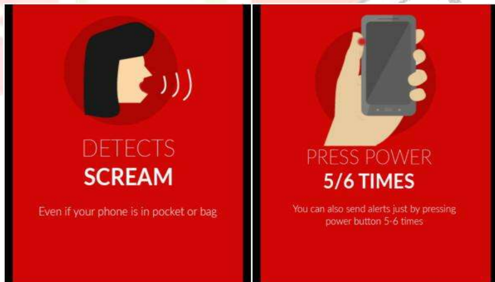
Fig: Noise Detection and Touch press

Similarly, the sound sensor of smartphone keeps on recording the intensity of the sound(noise) and when it detects a sound whose intensity crosses the pre-defined threshold, alert system gets activated and notifies registered people and nearby police stations.