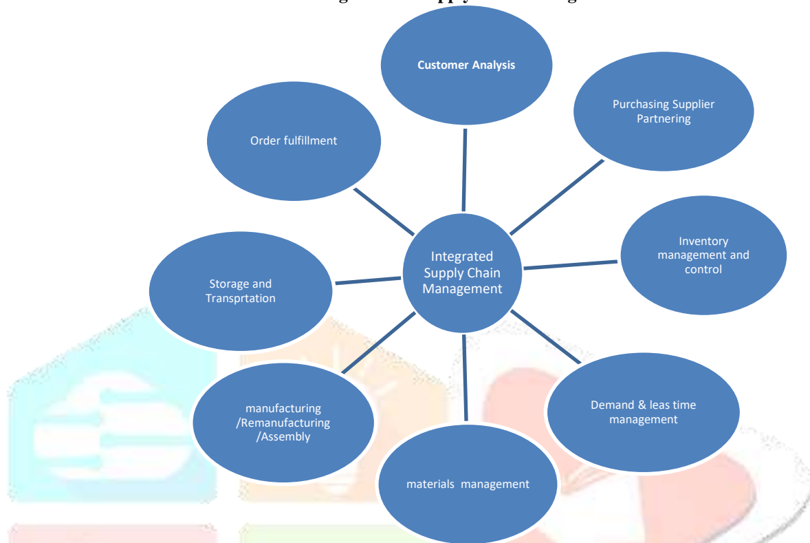
Figure No:2 Integration of supply chain management