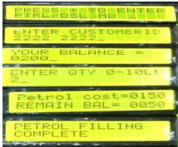
Fig. 4. Complete Filling Process