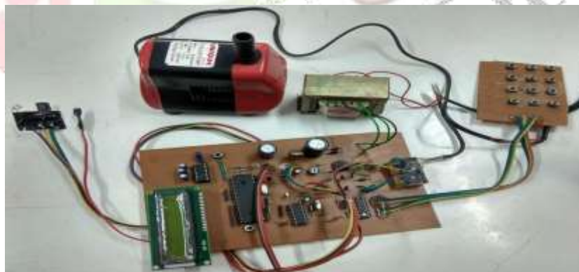
Fig. 3. Complete Experimental Setup

The complete hardware module and power supply unit is shown in figure 3 below. The system operates on very less power supply i.e. from 5V and 12V only which is easily available.