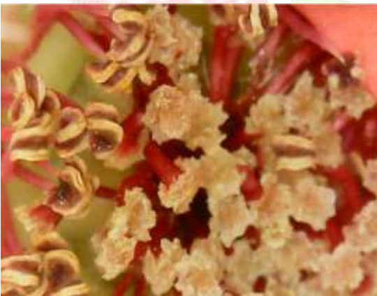
Figure 3: Inner View Of Flower