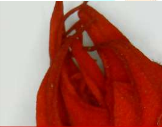
Figure 2: Outer View of Flower