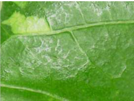
Figure 5: Leaf Vein