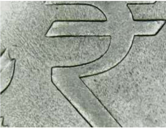
Figure 4: Coin