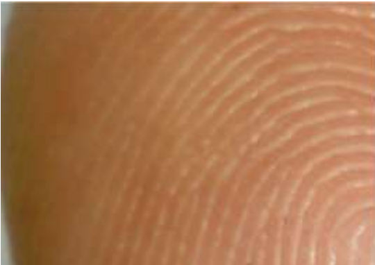
Figure 1: Fingerprint