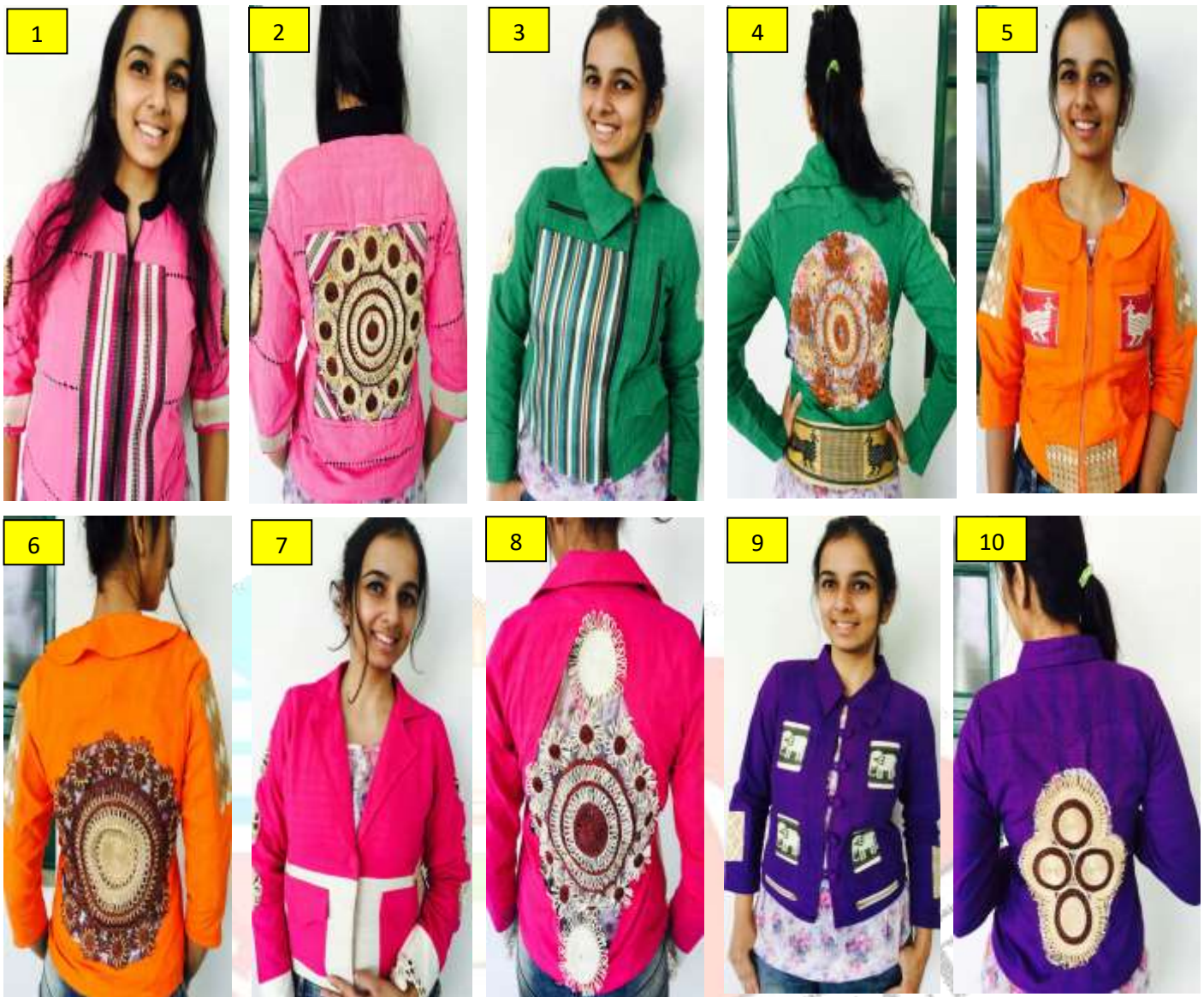
FIG 1 & 2 – Jacket is made using pink color handloom fabric in combination with Sri Lankan natural hana fiber mats. Patch work is done on front, Back and on sleeves of the jacket using mat.

FIG 3 & 4 – It is Asymmetric casual wear Jacket made using green color handloom fabric along with Sri Lankan natural hana fiber mats. Patch work is done on the right side of the front., Circle shaped on the back and also at the hem on back.