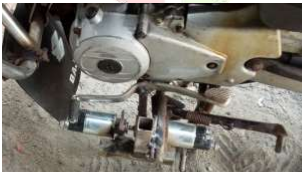
Fig.2.a. Button operated system setup

This project work has provided us an excellent opportunity and experience, to use our limited knowledge. We gained a lot of practical knowledge regarding, planning, purchasing, assembling and machining while doing this project work. We feel that the project work is a good solution to bridge the gates between institution and industries. The Button Operated Electro-Magnetic Gear Shifting System is working with satisfactory conditions. We are able to understand the difficulties in maintaining the tolerances and also quality. We have done to our ability and skill making maximum use of available facilities. Thus we have developed a "Button Operated Electro-Magnetic Gear Shifting System" which helps to know how to achieve low cost automation. The application of electro-magnetic coil produces smooth operation. By using more techniques, they can be modified and developed according to the applications.