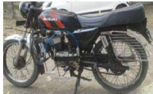
Fig.2.b. Vehicle with Button operated gear shifting