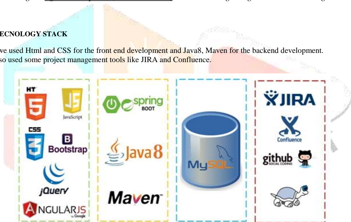
Fig -3: Technology Stack and Project Management Tool

Here we used Html and CSS for the front end development and Java8, Maven for the backend development. We also used some project management tools like JIRA and Confluence.