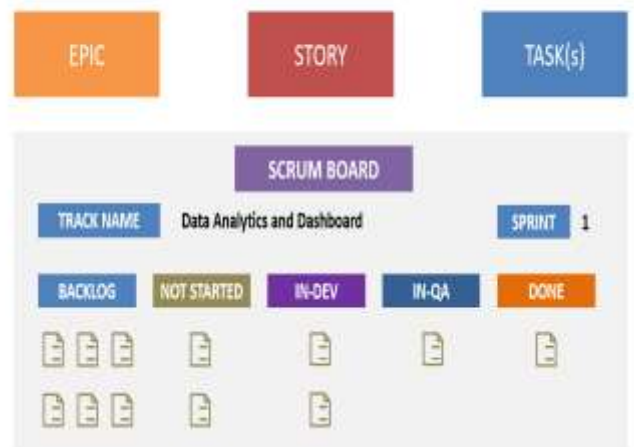
Fig-2: Agile Work model using SCRUM