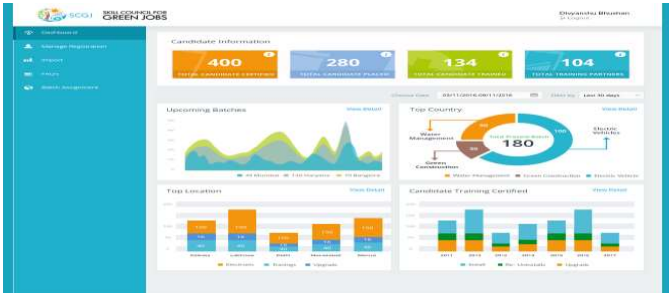
Fig -5: Proposed UI of Data Analytic and Dashboard

This fig. 4 shows the entire workflow of the Data Analytic and Dashboard. Firstly, the SCGJ or Super User login with their credential created through backend panel of database. Then and HTTP request will get real-time data from backend database. This response is then return in form of JSON object which will further populates high charts or info graphics and important fact and figures at the top just below the navigation bar.