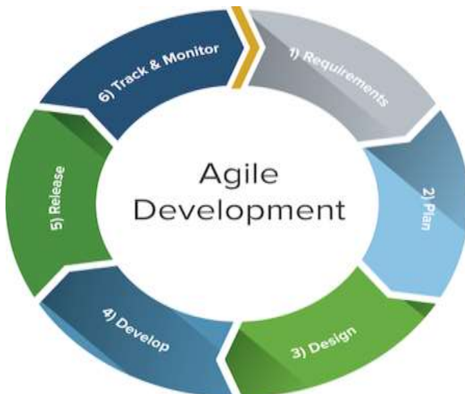
Fig -1: Agile Development (Various Phases)