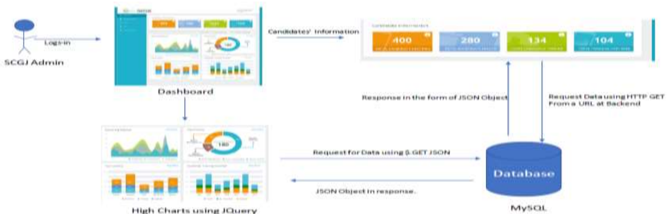
Fig -4: Work-flow of Data Analytic and Dashboard