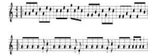
Figure 6: Excerpt from Experimental AI system.

In figure 3, the melody created by stochastic approach is repetitive and simple which leads to boring sound. In figure 4, the melody created by genetic algorithm shows variability however, the large step sizes between notes cause this song to lack coherence. Figure 5, the melody created by experimental AI system is much more creative and listenable. There is no repetition and lack of coherence.