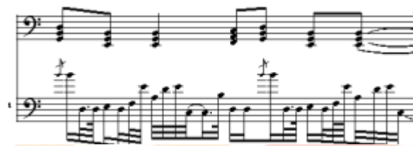
Figure 5: Excerpt from Genetic Algorithm Approach.