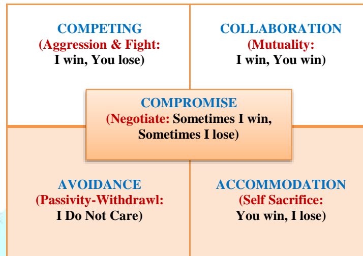
Figure 3 – Thomas-Kilmann Conflict (TKI) Mode of Conflict Management

In one of the powerful sutras of the literature of Rishi Sutra called Vidayenamihih Vairinam it has been explored that anger increases by anger and passion by desires. In order to control the anger, firstly we must know the anger and its root of emergence. Some of the important conflict management strategies have been discussed below.