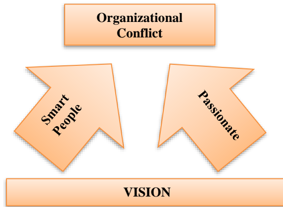
Figure 1- Occurrence of Organizational Conflict

The above figure describes that how the conflict occurs in an organization. It starts with an awesome Vision to accomplish, the organizational management gathers some Smart People and they are Passionate about accomplishing the objectives. All of a sudden these smart people start having very different opinions and then their different opinion comes with strong emotions because they have got a lot of passion and they stuck between the conflict of who is right and who is wrong.