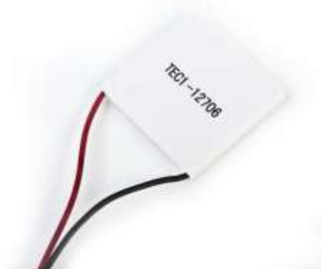
Fig 1 Peltier Plate

The Peltier effect is a temperature difference created by applying a voltage between two electrodes connected to a sample of semiconductor material. This phenomenon can be useful when it is necessary to transfer heat from one medium to another on a small scale. In a Peltier-effect device, the electrodes are typically made of a metal with excellent electrical conductivity. The semiconductor material between the electrodes creates two junctions between dissimilar materials, which, in turn, creates a pair of thermocouple voltage is applied to the electrodes to force electrical current through the semiconductor, thermal energy flows in the direction of the charge carriers. Peltier-effect devices are used for thermoelectric cooling in electronic equipment and computers when more conventional cooling methods are impractical.