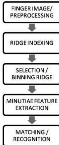
A. Flow of process

Image Preprocessing, Ridge Indexing, Selection/Binning of ridge , Minutiae Feature Extraction and Matching/ Recognition.