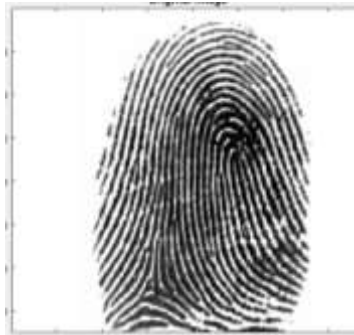
Figure 4:Original image

The fingerprint can be identified by matching the ridge ending and bifurcation point.