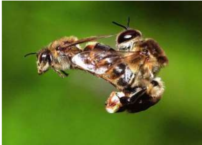
Figure 2 Drones mating with Queen bee