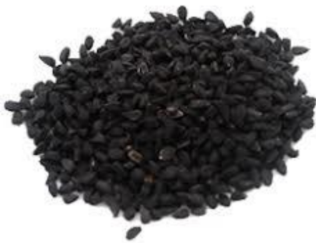
Nigella Sativa Seeds

Macroscopically, seeds are small dicotyledonous, trigonus, angular, regulose-tubercular, 2-3.5mm×1-2 mm, black externally and white inside, odor slightly aromatic and taste bitter. Microscopically, transverse section of seed shows single layered epidermis consisting of elliptical, thick walled cells, covered externally by a papillose cuticle and filled with dark brown contents. Epidermis is followed by 2-4 layers of thick walled tangentially elongated parenchymatous cells, followed by a reddish brown pigmented layer composed of thick walled, rectangular elongated cells. Inner to the pigment layer, is present a layer composed of thick walled rectangular elongated or nearly columnar, elongated cells. Endosperm consists of thin walled, rectangular or polygonal cells mostly filled with oil globules. The powder microscopy of seed powder shows brownish black, parenchymatous cells and oil globules.