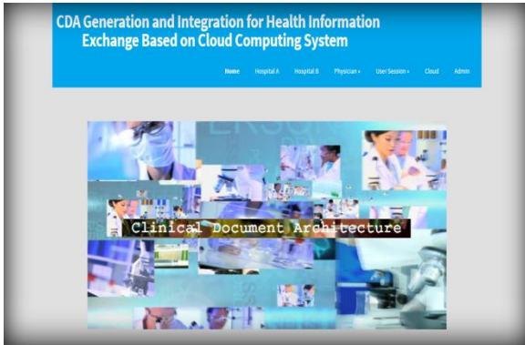
Fig: Home Page