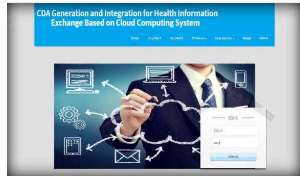
Fig: Cloud Login Page