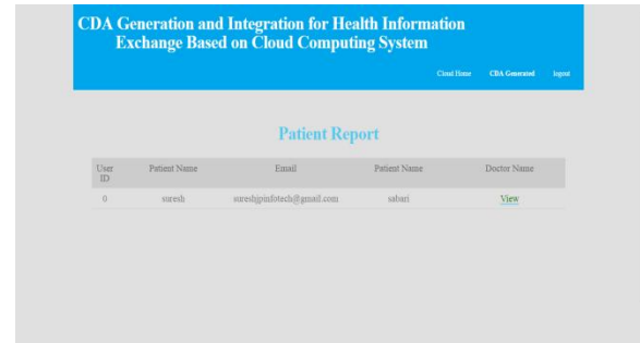
Fig: CDA Generation