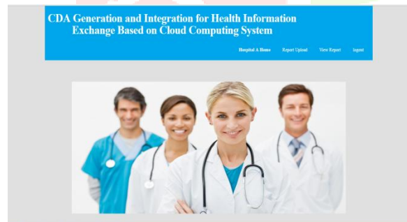
Fig: Hospital A Home