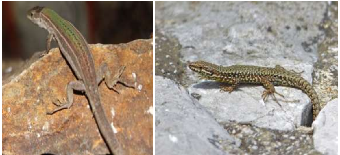
Fig. 1. Two similar-length individuals of Podarcis guadarramae lusitanicus (top) and P. bocagei (bottom). Notice the difference between these two species in terms of their relative body height and bulkiness.