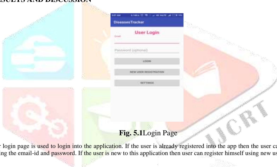
Fig. 5.1 Login Page

The user login page is used to login into the application. If the user is already registered into the app then the user can directly login by entering the email-id and password. If the user is new to this application then user can register himself using new user registration.