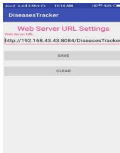
Fig. 5.2 URL Settings

The user login page is used to login into the application. If the user is already registered into the app then the user can directly login by entering the email-id and password. If the user is new to this application then user can register himself using new user registration.