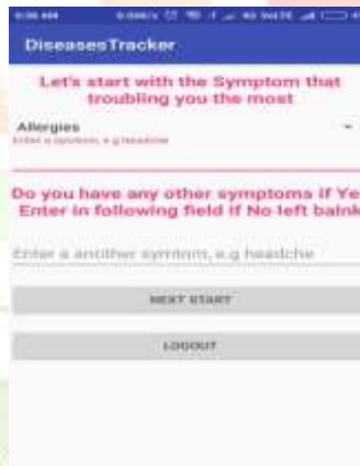
Fig. 5.4 Disease Search Page

The registration page is used for the registration of new users into the application. The user can register by entering his required details into the application.