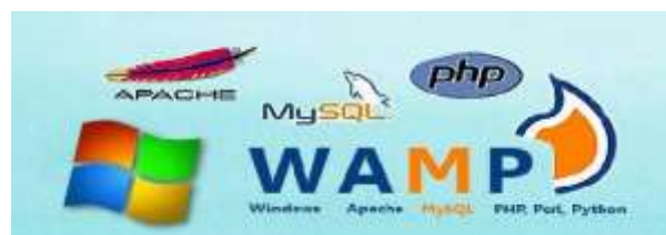
Fig. 2.2 WAMP Stack

Perl is the extraction language as its name suggested “Practical Extraction and Reporting Language”. Perl is the first great language for people which require no prior programming experience. Perl is the language of Unix /Linux environment and comes pre-installed on most of non-Windows operating systems. CPAN, the Comprehensive Perl Archive Network, is main and huge library for Perl and it is freely available and makes Perl exceedingly simple to create useful programs. In common language the Perl program are known as Perl scripts [11].