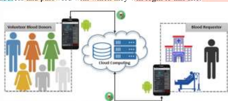
Figure 1. The Proposed Architecture

I. Introduction: A Genuine person from the Administrator side will collect information about the blood donor like contact and address details for registration. After filtering the invalid data, the Blood donor will be uploaded in Online Blood Bank System site for general users. Before uploading their details, the Administrator will give unique username and password to each donor. The Administrator can also add new donor who registered through site and allows him to create his own account. The administrator searches various donors details based on normal or map based search. The administrator can view the account information and can also view the suggestion (feedbacks) given by different users of this site. The administrator can view total report of the site. Every donor will have their own e-mail address and password with which they will login to this site.