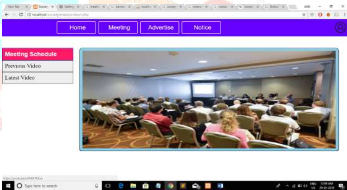
Fig 2: Meeing Section