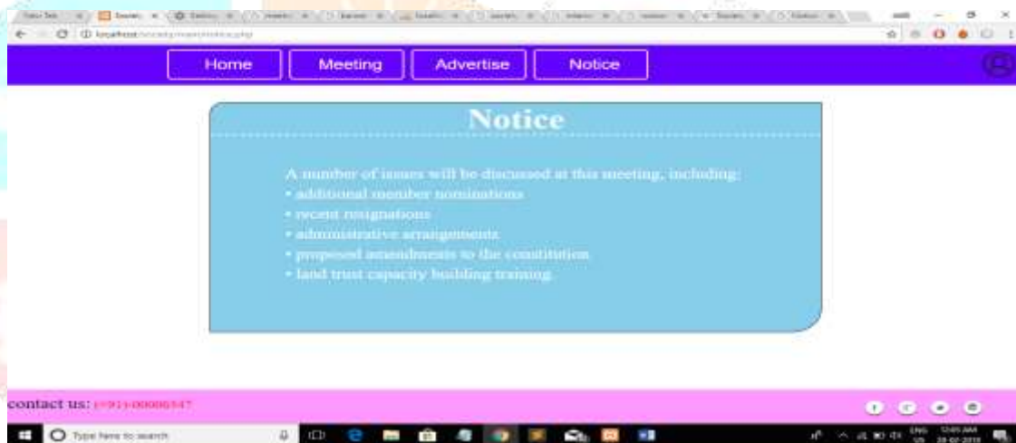
Fig 4: Notice Section