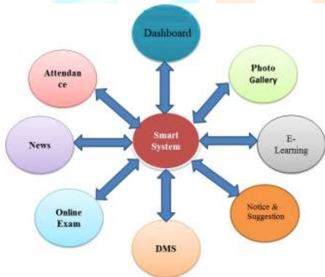
Fig.1: General Architecture of Academic Smart System.

ASP .Net and MSSQL are two ways to make your site dynamic. The real beauty of ASP .Net, SQL Server, JavaScript, and CSS is the wonderful way in which they all work together to produce dynamic web content: ASP .Net handles all the main work on the web server, SQL Server manages all the data, and the combination of CSS and JavaScript looks after web page presentation. JavaScript can also talk with your ASP .Net code on the web server whenever it needs to update something (either on the server or on the web page). ASP .Net is a robust, Server-side, Semi open source scripting language that is extremely flexible and actually fun to learn. SQL Server is the standard query language for interacting with databases. SQL Server is a Semi open source, SQL database server that is more or less free and extremely fast. SQL Server is also cross platform.