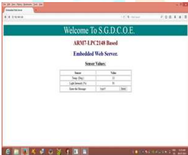
Fig.3 Result for Petite Embedded server