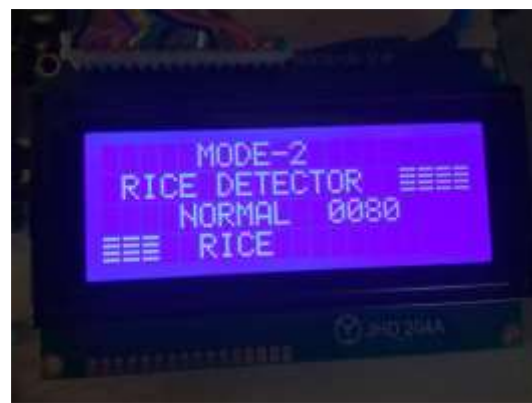
Figure 3.5 Normal Rice Sensing and Display of normal rice indication in LED display

2. Red color Test: The Red color rice was tested in our instruments and it's showed no warning indication. Also GSM based warning information's also not received. These testing result shown in below diagram.