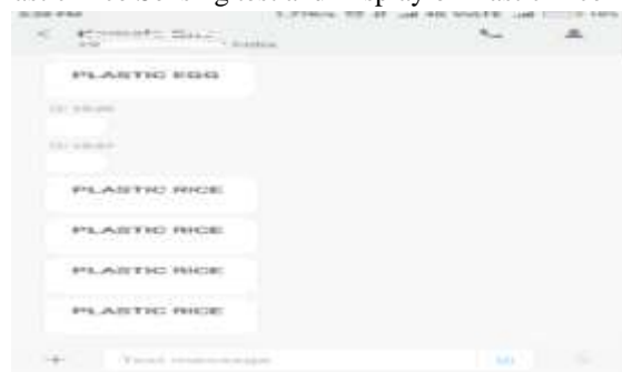
Figure 3.9 Message of Plastic Rice through GSM