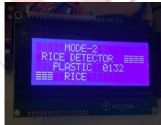
Figure 3.7 Plastic Rice Sensing test and Display of Plastic Rice in LED display