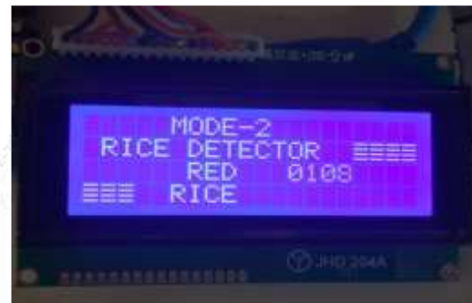
Figure 3.6 Red Rice Sensing and Display of normal rice indication in LED display

3. Plastic rice Test: The plastic rice was tested in our instruments and it's showed the warning indication in display and buzzer. Also GSM based warning information's also received through registered mobile number. This entire test results are shown in below figures.