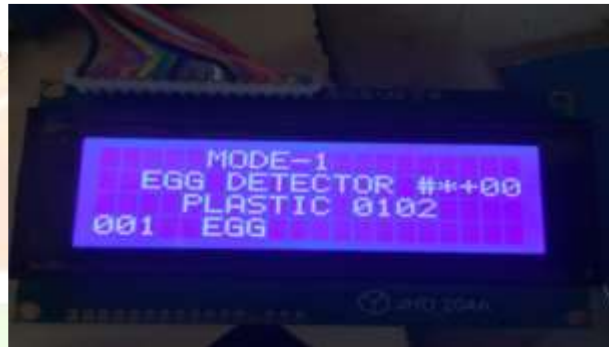
Figure 3.3 Display of Synthetic Egg

After the display and buzzer indication, automatically we received the Text message like PLASTIC EGG as a message through registered mobile number. This result was shown in below figure.