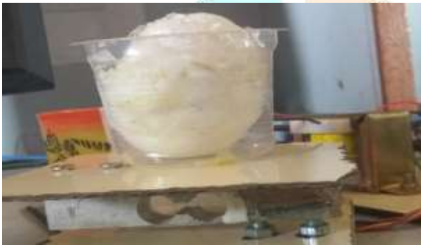
Figure 3.2 Synthetic Egg in Strain Gauge

2. Synthetic Egg Test: The synthetic egg was tested in our instruments and it's showed the warning indication in the both display and buzzer. Also GSM based warning information's also received through registered mobile number. These process results are shown in below figures.