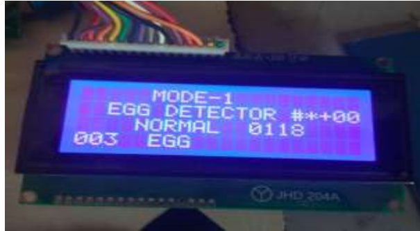
Figure 3.1 Display of normal egg in LED display

1. Normal Egg Test: The normal egg was tested in our instrument and it's showed no warning indication as a result. Also GSM based warning information's are not received. This testing results shown in below diagram.