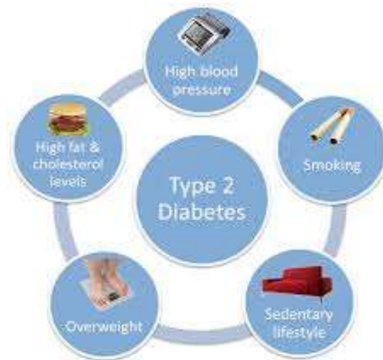
Figure1: Main reasons of type 2 diabetes