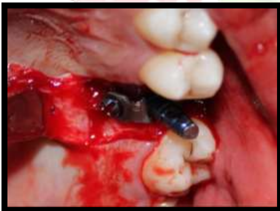
Fig 4. Hybrid implant secured with 6mm screw and abutment projecting into the oral cavity