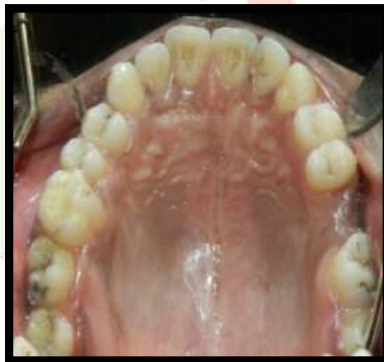
Fig 1. Pretreatment photograph showing missing 26