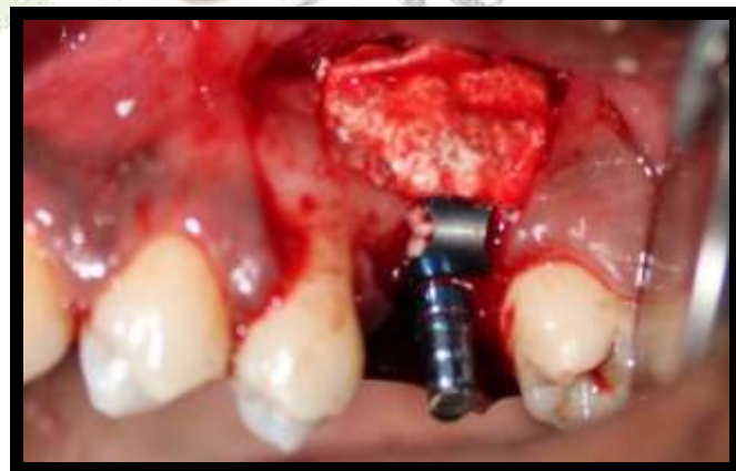
Fig 5. Guided Bone Regeneration with particulate bone graft and PerioCol Membrane