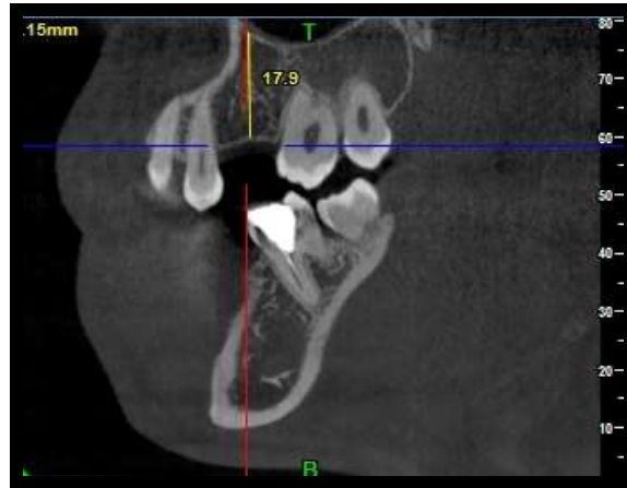
Fig 2b. Pretreatment CBCT showing bone height of 17.9mm