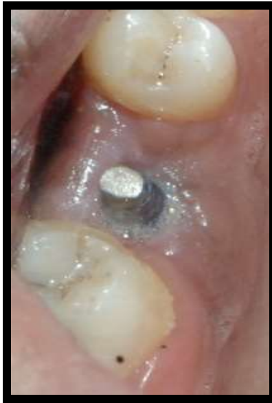
Fig 6. 30 days post operative showing satisfactory wound healing