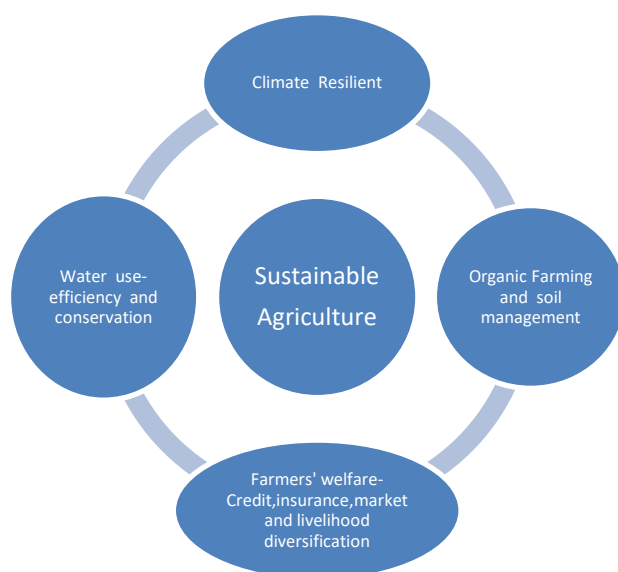
Figure No. 1-Key Areas of India's Approach

The world is concerned about globalised problems like climate change, global warming, environmental degradation, burgeoning population and prevalent food insecurity etc. In this background, India has followed a comprehensive approach for the welfare of its citizens along with the protection of environment to meet commitment of international agreements like Paris Climate Change Agreement (2015). India has adopted a multi-pronged strategy which will not only help in revival of agricultural sector but also lead to development of sustainable agriculture, directly or indirectly.