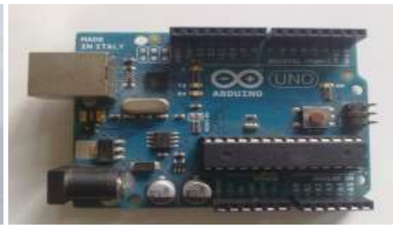
Fig 2. GSM board of SIM 800