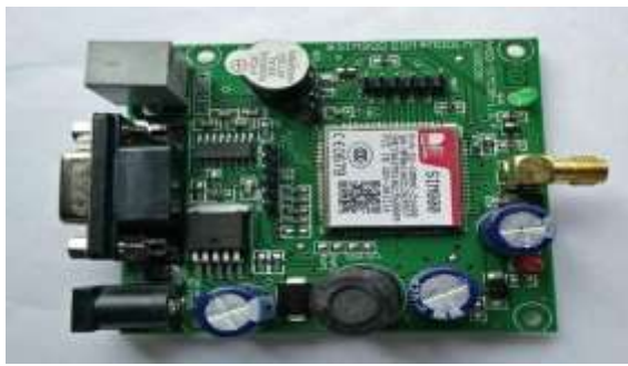
Fig.1 : Arduino UNO Board