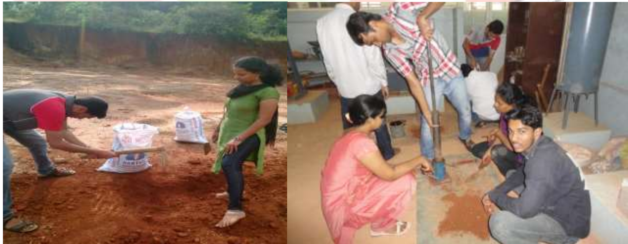
Fig 1 Collection of Lateritic Soil Sample and Laboratory Testing

Following are the major soil properties analyzed during the present investigation. Grain size analysis(wet), Field density of soil by core cutter method, Specific gravity of soil, Consistency limit determination, Compaction(Modified Proctor), UCC, and CBR value of the soil.