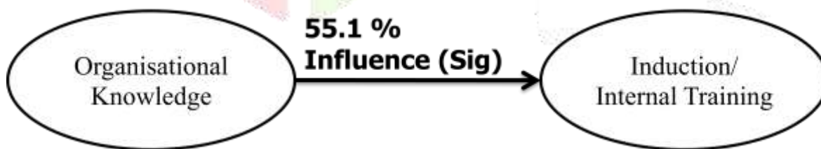
Figure 4.1 Influence of Organisational Knowledge on Induction/Internal Training

It indicates that for each change of one unit in the managing organisational knowledge, the average change in the mean of induction/internal training is about 0.664units, which is of considerable magnitude and significance. This implies that new joiners of the organisation have to link the knowledge with the induction/internal training programmes for the programme to be effective.