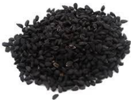
Nigella Sativa Seeds