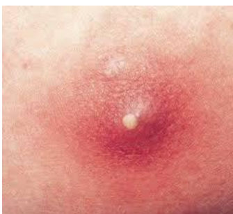
Fig (1) Abnormal Image.

Skin growth is the deadliest type of disease in the event that it isn't recognized in beginning time. Skin growth may show up as benevolent melanoma and harmful melanoma. Favorable melanoma is appearance of mole on skin. Harmful melanoma is deadliest type of tumor in this manner it needs prompt identification. Dangerous melanoma emerges from malignant development in pigmented skin lesion. Melanocytes are the shades offering shading to skin which for the most part begins with a little district later spreads to the next skin zones through lymphatic framework or blood. In typical case old cell supplanted by new cell while if there should arise an occurrence of disease they develop in irregular way it end up plainly malignant because of hereditary issue by outer or inward factor. Human skin is made of three layers - dermis, epidermis and hypodermis. Dermatology is the limb of restorative science that is worried about analysis and treatment of skin based turmoil. Beginning period identification of skin growth needs PC helped location. By and large, specialists utilize biopsy technique for the conclusion of skin growth. Biopsy is the expulsion or rejecting off the skin and those skin tests are experienced. There are many strides for conclusion of skin disease, for example, preprocessing, segmentation, feature extraction classifier for determination.