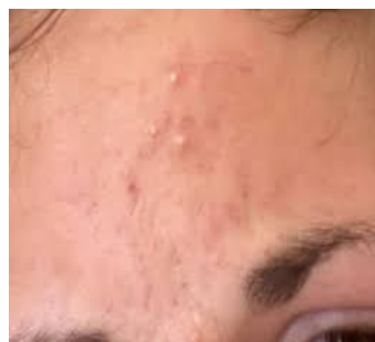
Fig (2) Normal Image.