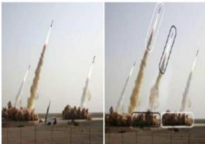
Fig.3. Example of Copy-Move Attack on Images

The copy move forgery is popular as one of the difficult and most commonly used kind of image tampering technique. In this technique, one needs to cover a part of the image in order to add or remove information. In the Copy-Move image, manipulation technique a part of the same image is copied and pasted into another part of that image itself. In a copy-move attack, the intention is to hide something in the original image with some other part of the same image [8]. The example of Copy-Move type is as shown in below figure 3 below. The original image contains only three missiles and its Copy-Moved version on the right has four missiles. Fig.3. Example of Copy-Move Attack on Images