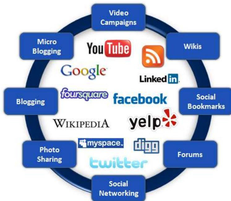
Figure 1: Social Media