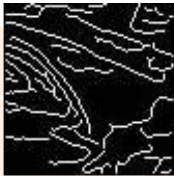
Figure 4: Output ROI Palm Image showing Edges extracted using canny filter