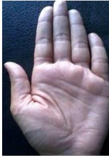
Figure 3: Input Palm Image